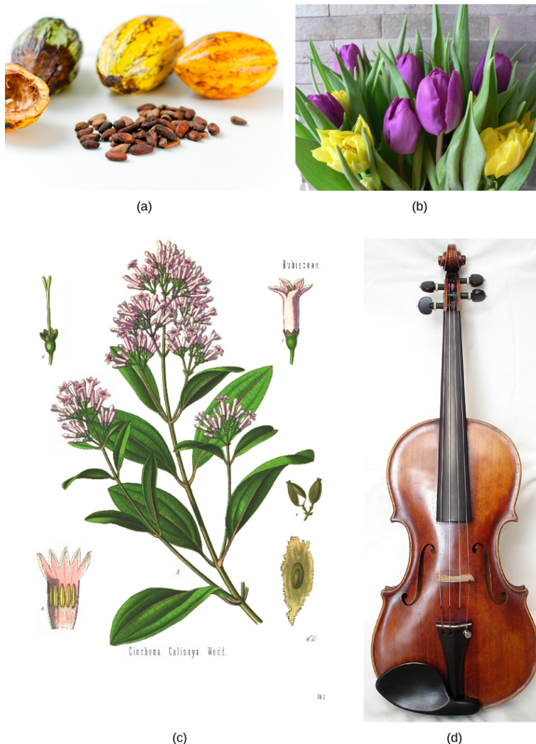
Figure 26.22 Human uses of plants. Humans rely on plants for a variety of reasons. (a) Cacao beans were introduced to Europe from the New World, where they were used by Mesoamerican civilizations. Combined with sugar, another plant product, chocolate is a popular food. (b) Flowers like the tulip are cultivated for their beauty. (c) Quinine, extracted from cinchona trees, is used to treat malaria, to reduce fever, and to alleviate pain. (d) This violin is made of wood. (credit a: modification of work by "Everjean"/Flickr; credit b: modification of work by Rosendahl; credit c: modification of work by Franz Eugen Köhler)

Lastly, it is more difficult to quantify the benefits of ornamental seed plants. These grace private and public spaces, adding beauty and serenity to human lives and inspiring painters and poets alike.