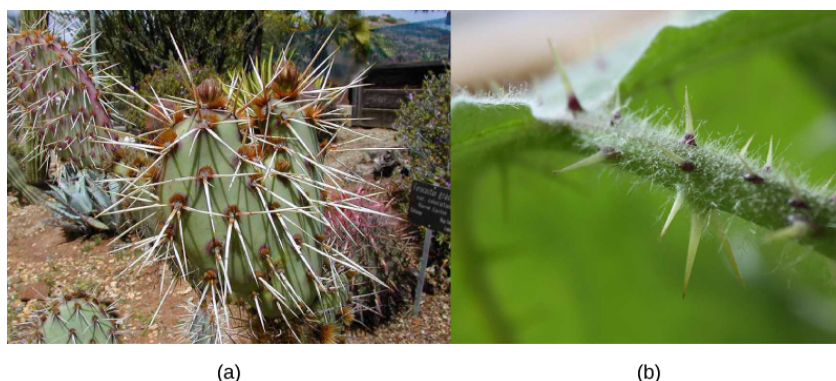
Figure 26.20 Plant defenses. (a) Spines and (b) thorns are examples of plant defenses. (credit a: modification of work by Jon Sullivan; credit b: modification of work by I. Sáček, Sr.)

Coevolution of flowering plants and insects is a hypothesis that has received much attention and support, especially because both angiosperms and insects diversified at about the same time in the middle Mesozoic. Many authors have attributed the diversity of plants and insects to both pollination and herbivory , or the consumption of plants by insects and other animals. Herbivory is believed to have been as much a driving force as pollination. Coevolution of herbivores and plant defenses is easily and commonly observed in nature. Unlike animals, most plants cannot outrun predators or use mimicry to hide from hungry animals (although mimicry has been used to entice pollinators). A sort of arms race exists between plants and herbivores. To “combat” herbivores, some plant seeds—such as acorn and unripened persimmon—are high in alkaloids and therefore unsavory to some animals. Other plants are protected by bark, although some animals developed specialized mouth pieces to tear and chew vegetal material. Spines and thorns (Figure 26.20) deter most animals, except for mammals with thick fur, and some birds have specialized beaks to get past such defenses.